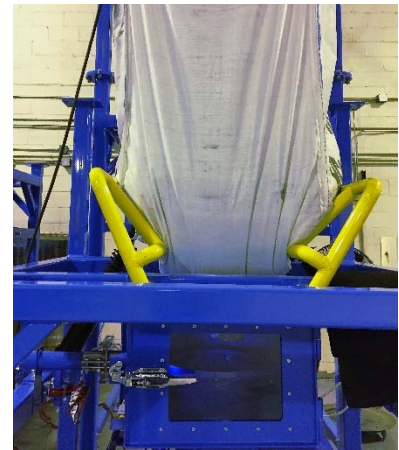
MASSAGE-IT™ BAG AGITATION