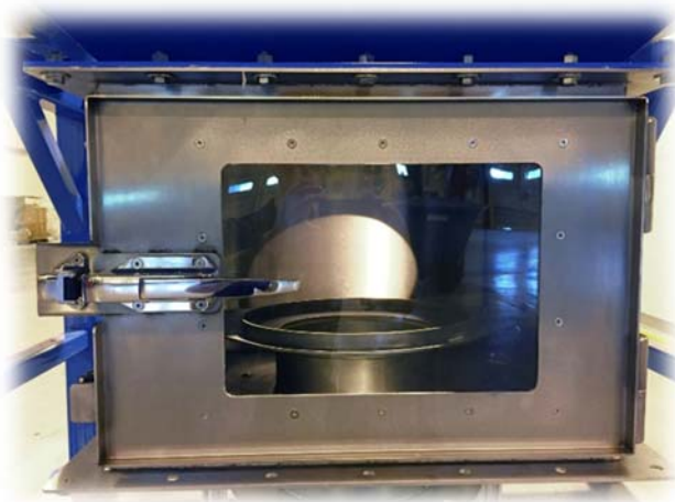
THE ORIGINAL CONTAIN-IT™ CHAMBER

Our oversized Contain-It™ Chamber contains all product spills. The heavy duty design is built for years of trouble-free operation.