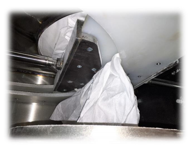
Close-It™ Valve System

The operator uses the Close-It<sup>™</sup> bag spout valve system to accurately fill drums. In this instance the operator manually operates the valve, partially closing and then completely closing the Close-It<sup>™</sup> valve, thereby stopping the flow of product and accurately filling the drums