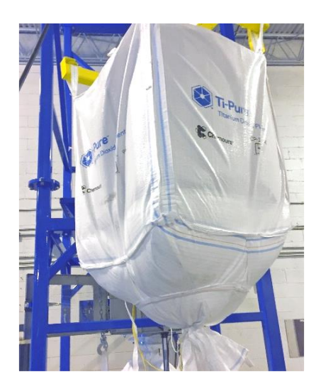
Bag Shaped by Vertical Vibration